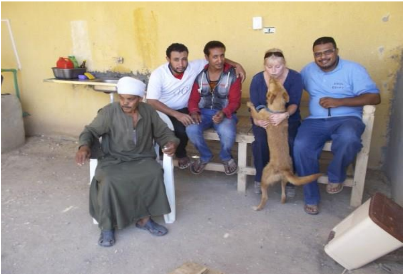
Part of the AWOL team.