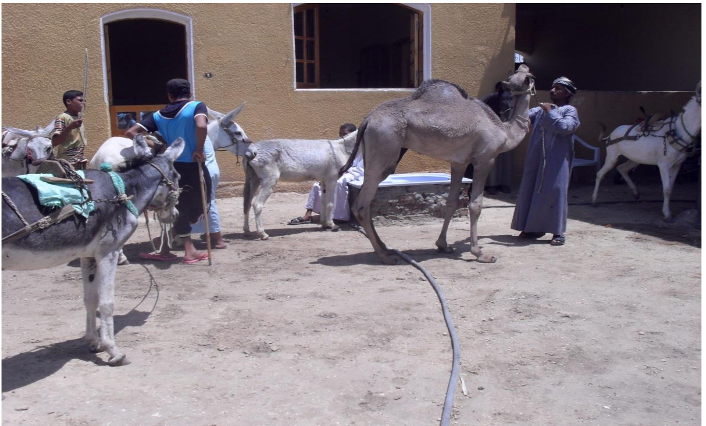
AWOL treats all kinds of animals. This camel had a severe tick infestation.