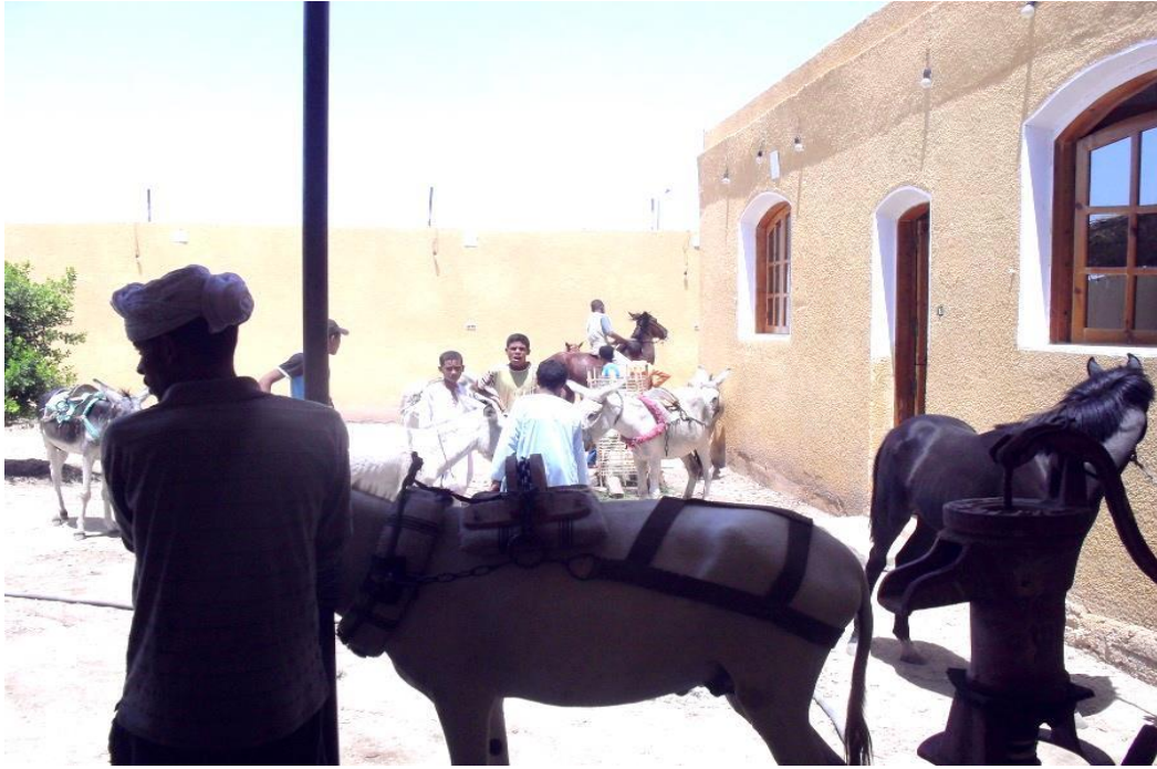
Plenty of patients queuing up for treatment.