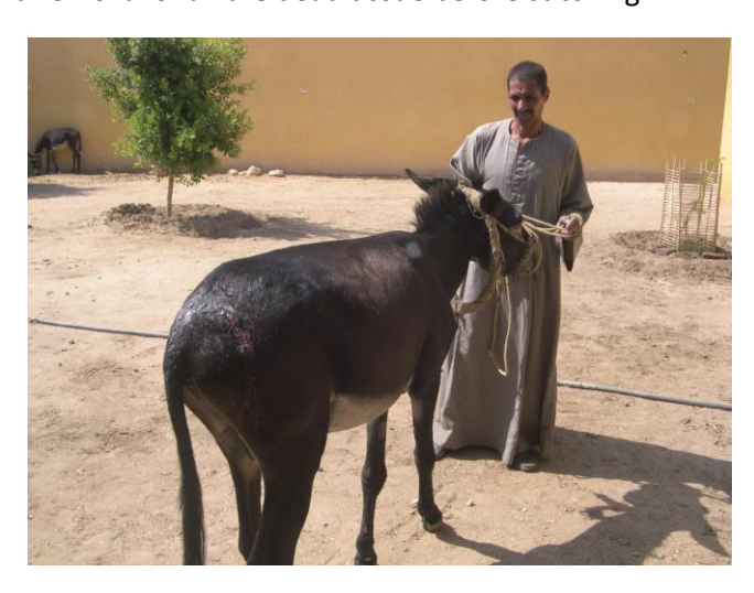
Standing after treatment is finished.