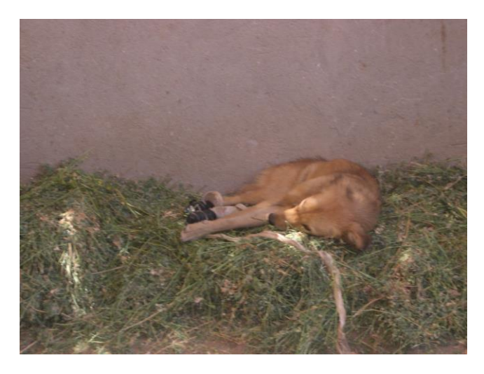
The dog's feet have been treated and dressed and she is left in peace at the AWOL centre to recover from her ordeal.