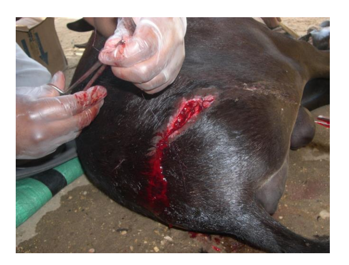
The wound is very deep and needs cleaning and removal of all the dead tissue before stitching.