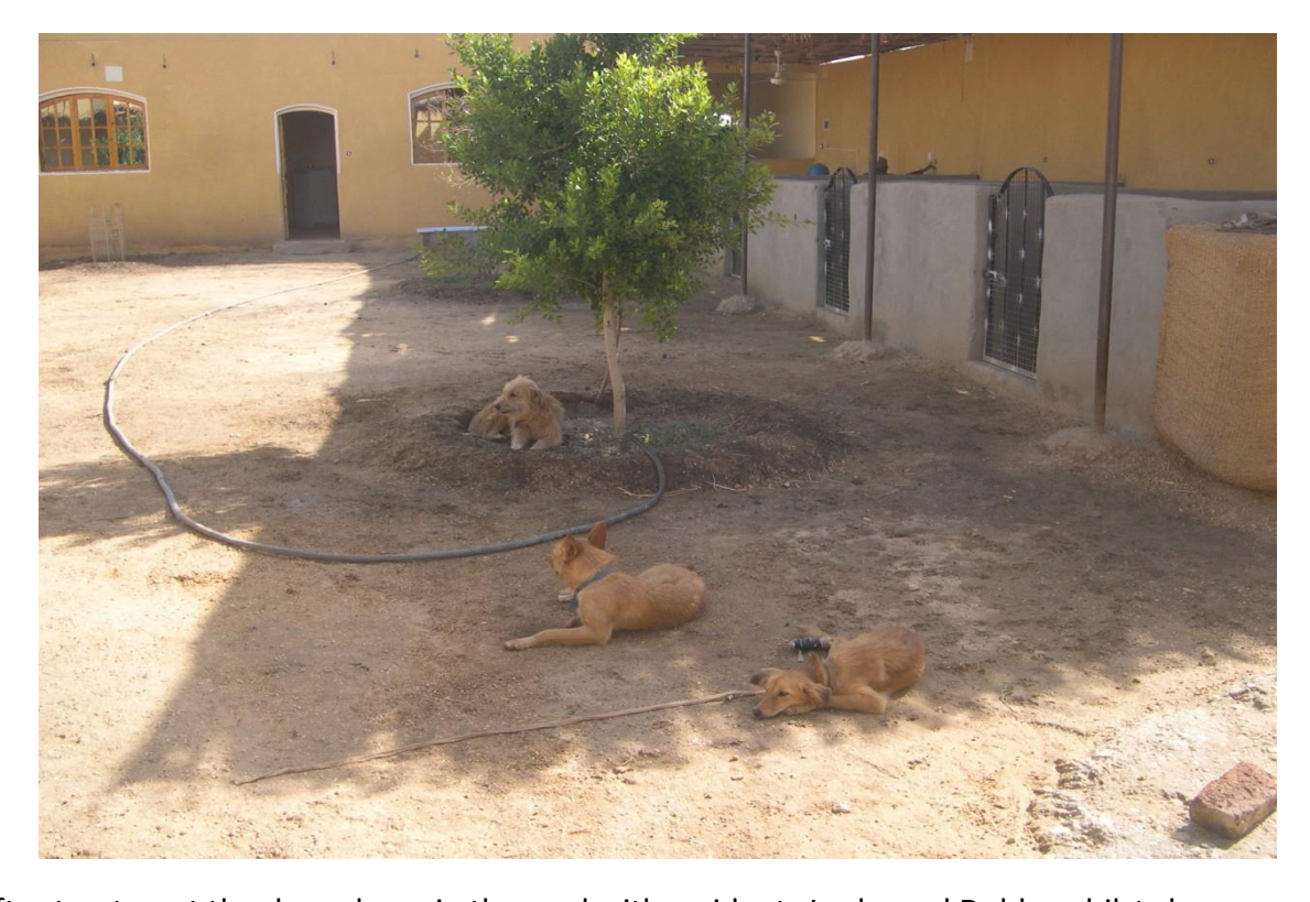
After treatment the dog relaxes in the yard with residents Lucky and Dobby whilst she recovers.