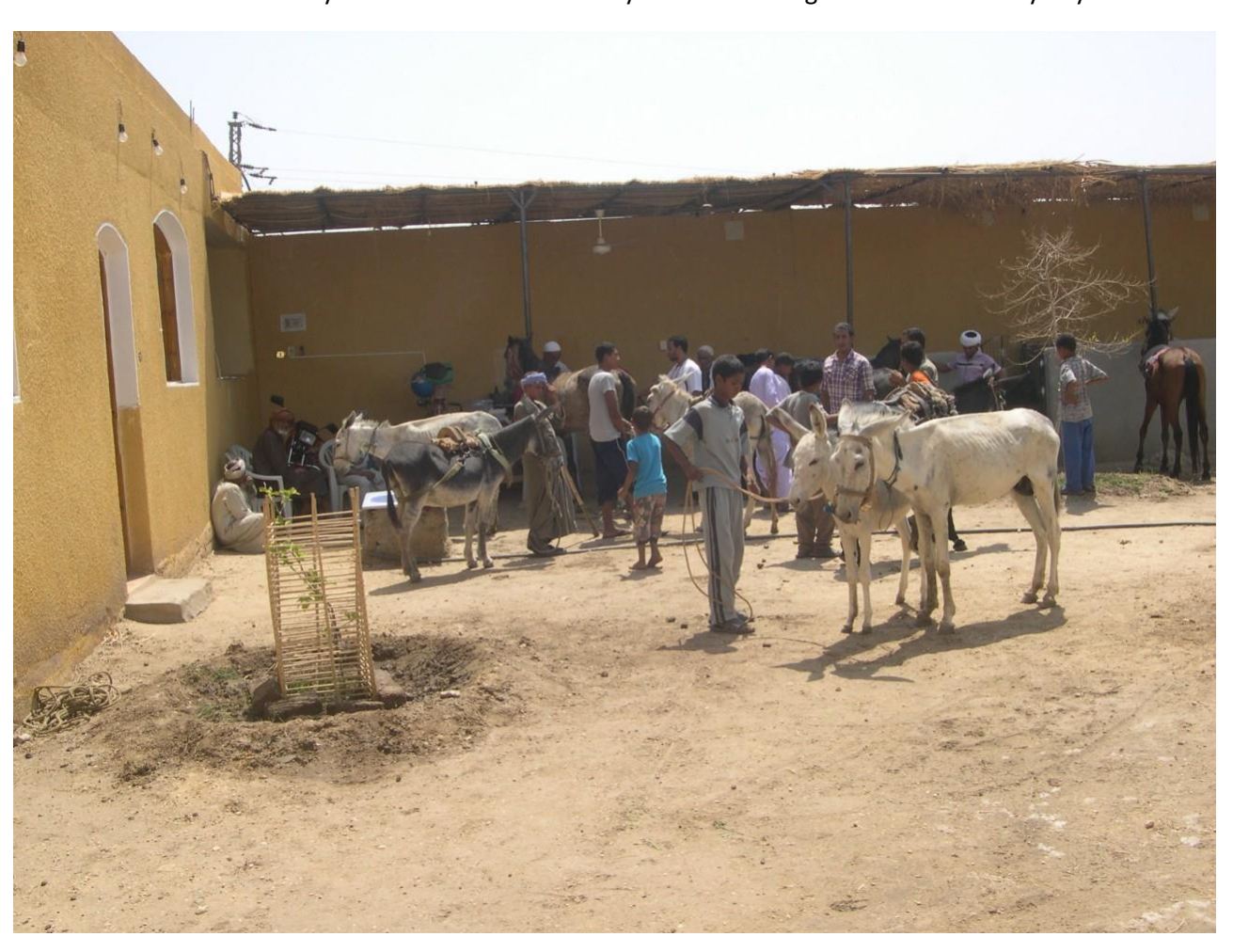
This is why AWOL is needed! So many animals waiting to be treated every day.