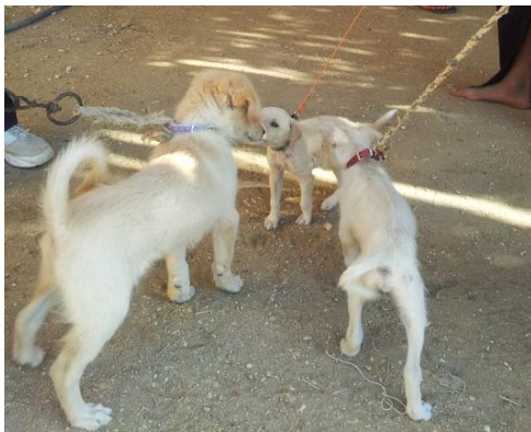
Time to socialise whilst waiting for treatment!