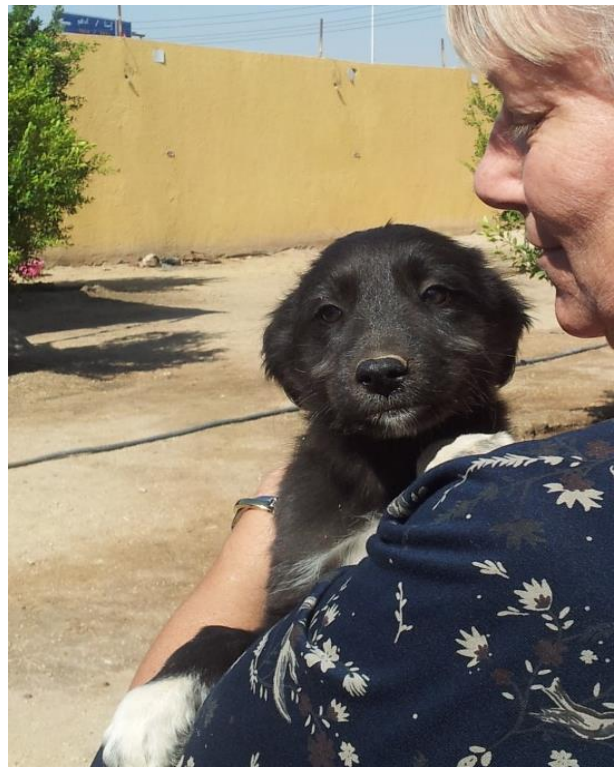
A very scared little puppy.

The little black puppy was not as lucky as the puppies who were brought in for check-ups. Two were brought in as unwanted and left at the centre. One was confident and happily trotted out of the kennels with the three AWOL resident dogs but this one would not come out. Eventually going into the kennels to get him out he was absolutely terrified and backed in to a corner screaming; a really horrible sound. He since spent 3 days living with me and made great progress, becoming so much more confident that he was eventually able to be re-homed with a local family who wanted a puppy for their daughters. The little girls were introduced to the puppy gradually and the necessity of being gentle was emphasized. I think you can see below that the puppy is very happy in his new home and is now a very lucky little dog! Aptly the family have chosen to call him Lucky (a popular name for AWOL rescue dogs)! We love a happy ending at AWOL!