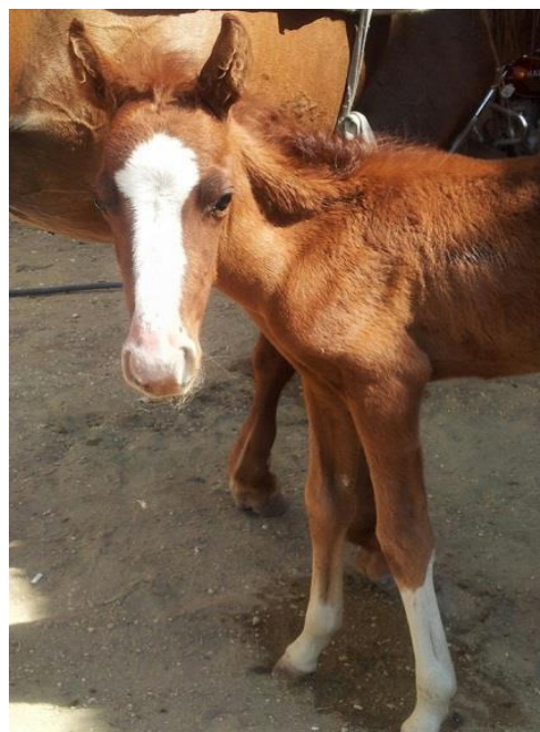
The hungry little foal with her mother