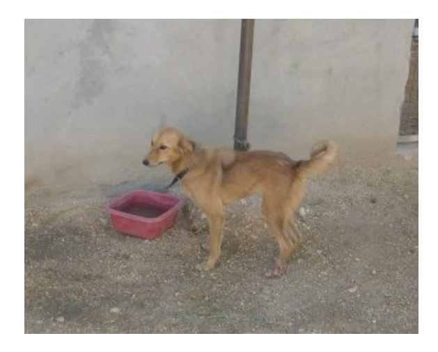
You might remember this little dog who had her back feet run over by a car whilst searching for food; she has been rehomed and has recovered well from her accident. She often pops into the AWOL centre with her owner for a visit.