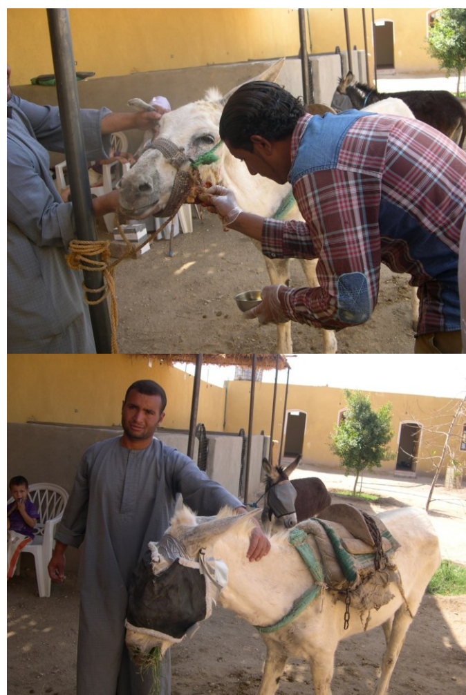
This donkey had a very nasty injury to his face. After cleaning and stitching the wound the donkey was hooded to keep it calm before returning home. He will return for a check-up in around a week.