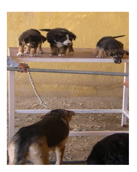
3 lovely little puppies brought in with their parents for their initial worming treatment and check-up.