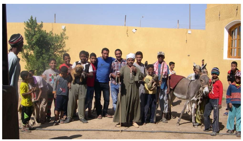
Part of the AWOL team with happy customers.

All the AWOL team, in Luxor and the UK, would like to thank our supporters for ensuring that AWOL is able to provide the care Luxor's animals so desperately need. We appreciate all your contributions, no matter how small, as we understand that many of you would like to give more but are unable to. We wish you all a very Happy Christmas and look forward to your continuing support for 2014.