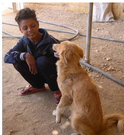
This pretty dog was hit by a car and is lame on the front left leg. After examination no broken bones were found but there is swelling and bruising which a course of anti-inflammatories and a pressure bandage should sort out.