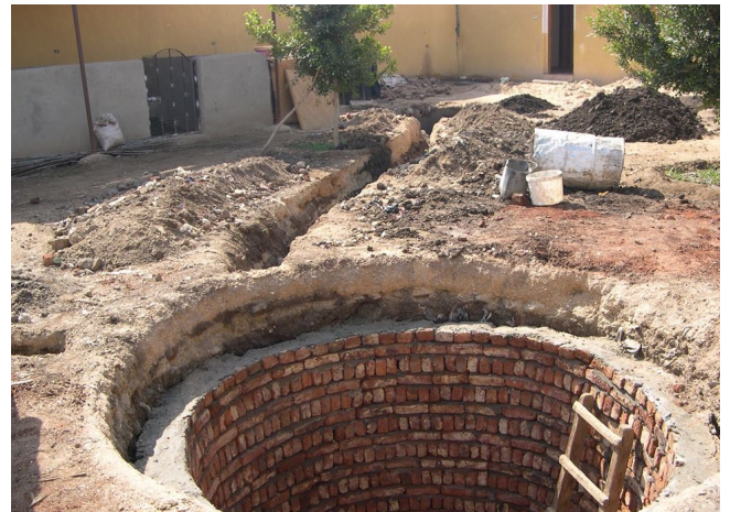
New drains and cesspit being constructed.

Now that Egyptair has reinstated direct flights to Luxor we hope to see some more of our supporters visiting the centre and this work will improve the experience. Luxor is not experiencing the trouble seen in other areas of Egypt and remains a safe destination. Now is a great time to visit as the evenings are getting warmer and the daytime temperatures are not too high; the tombs and temples are free of crowds and there are some great deals at some of the hotels. We are always pleased to see supporters at the centre; check the website for visiting and opening times.