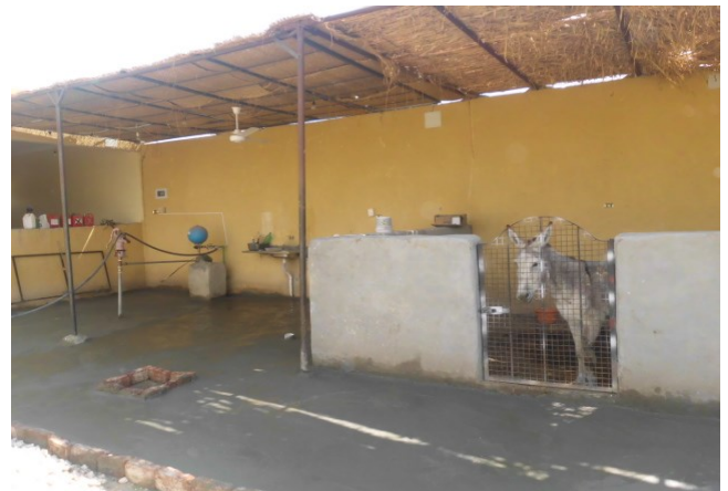
An interested patient watches as the work is carried out!