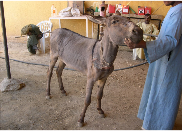
This poor donkey illustrates how bad tack can cause painful injuries. He has sores all over his body caused entirely by unsuitable tack; here you can see the sores on his nose and chest.