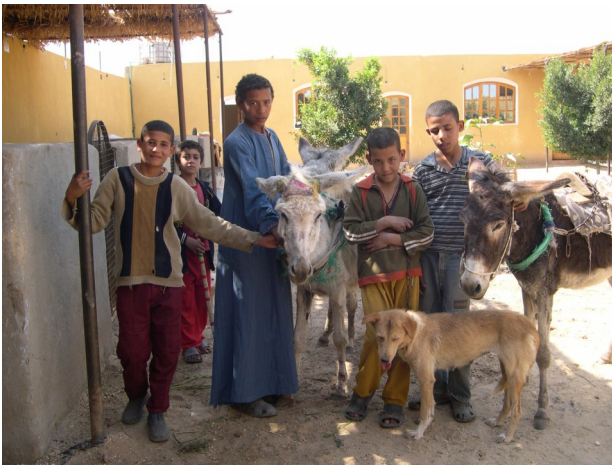
Patients and their owners waiting for treatment.