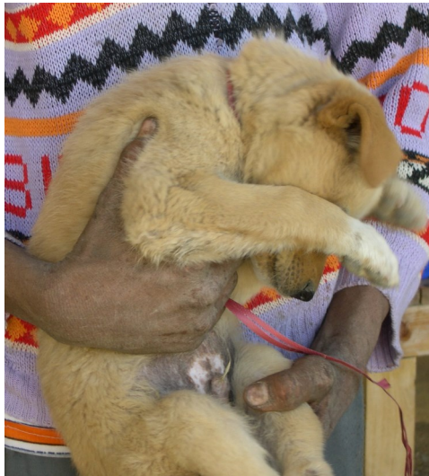
He might look bashful but this little dog actually had a weeping eye which should fully recover after a course of antibiotics and anti-inflammatories.