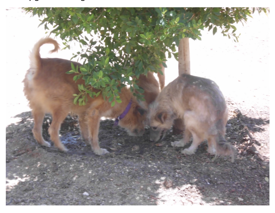
Or maybe it's just a nice cool spot to have a lie down!