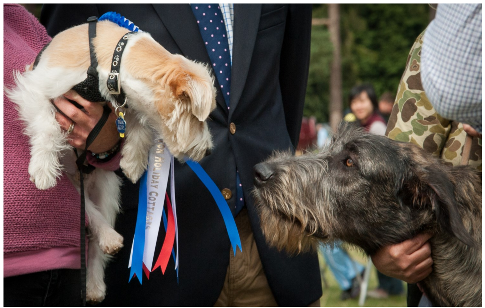
A big thank you to all our dog show sponsors and those who came and made it such a success!