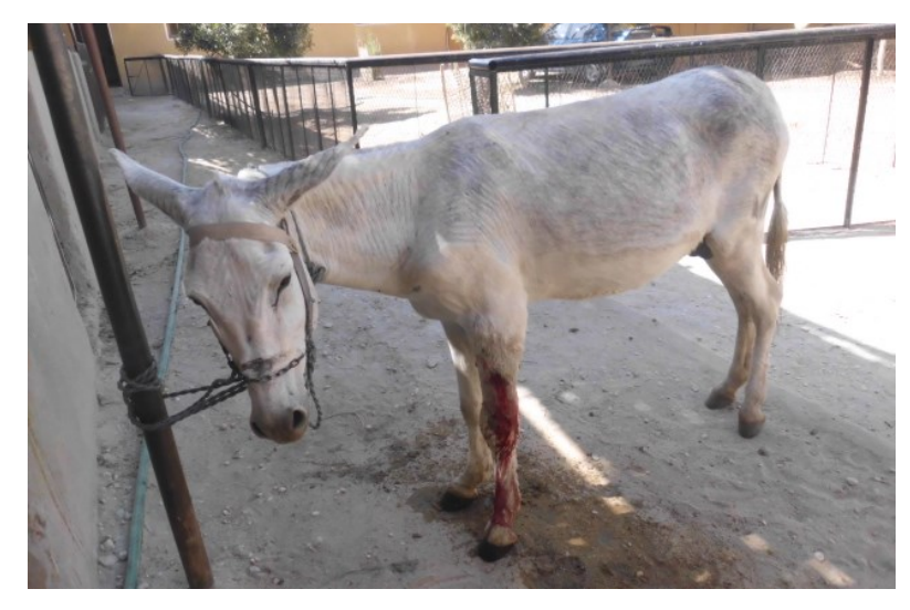
This donkey had a very nasty leg wound caused by a bite by another donkey. Prompt treatment at the AWOL centre should ensure no infection sets in and the donkey will make a swift recovery.