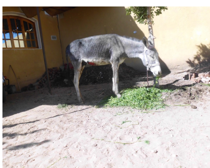
After treatment the donkey tucks into a meal of fresh greens!