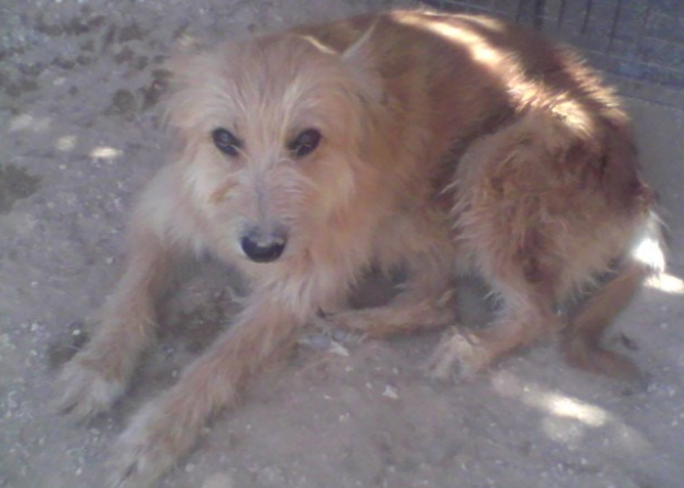
The AWOL dogs, Dobby, Tufty and Lucky, had a special treat at the weekend when supporter Rose visited the centre and gave all the dogs some beauty treatment! They are looking beautiful with their newly groomed coats.