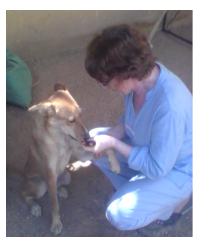
A reminder of how Dobby and Lucky looked when they were first treated at AWOL. They must be two of the luckiest dogs in Luxor!