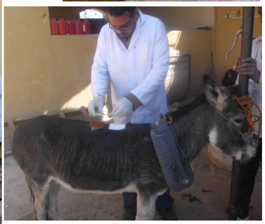
Donkeys like this one will appreciate his efforts though!