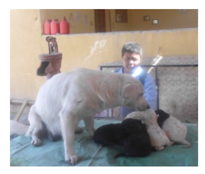
This mother and her puppies came in for flea treatment as the owner noticed they were constantly scratching. They were too young for an injectable flea treatment so were treated with a safe spray instead and also received treatment for anaemia caused by the fleas.