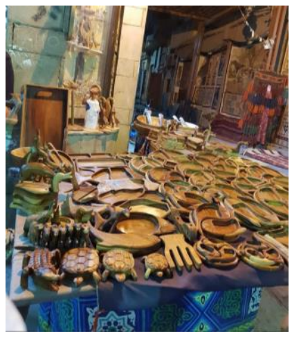
Many thanks to some local Luxor businesses who have supported AWOL this year. We are very grateful